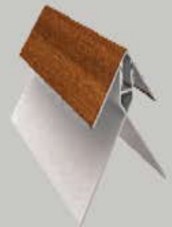
Corner Trim (Inside & Outside)

12' Aluminum | 2-Piece System (Base & Top) For transitions | Exposure Width: 2 1/2"